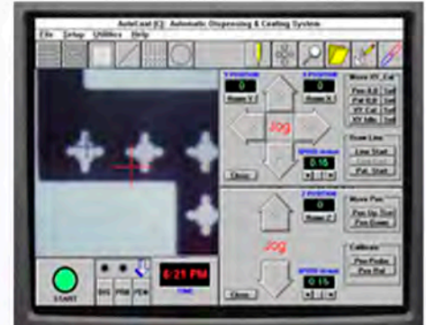
GUI Display of Menu and Image

Dimension & Weight 1400mm(W)x1200(D)x1650(H), 600 Kg